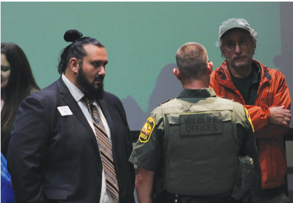
Hocking College students participated in a dynamic Natural Resources Discussion panel on Friday, September 27th! They shared insights, asked questions, and learned from industry professionals.