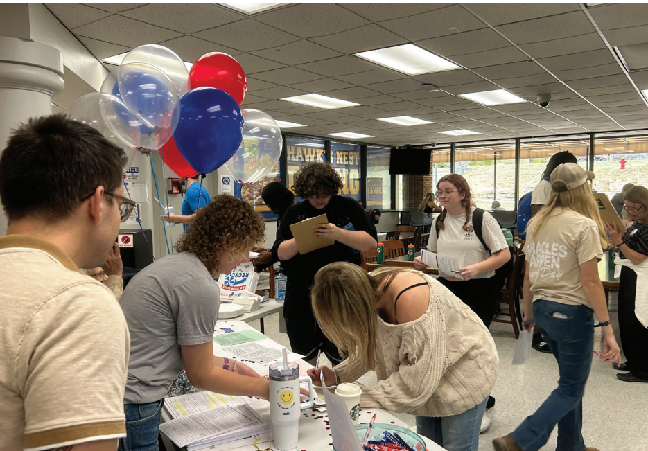
Hocking College participated in Voter Registration Week Sept 16-20, with three events registering 151 students to vote.

Hocking College is excited to host the 3rd annual "Rodeo on the Hocking" on Saturday, October 19th, at the Hocking Arena. Doors open at 5:30 p.m., with thrilling rodeo events kicking off at 7 p.m. The evening will feature action-packed competitions, including team roping, bull riding, saddle bronc, calf roping, steer wrestling, bareback riding, barrel racing, and cowgirl breakaway roping. Attendees can enjoy food trucks, vendors, and family-friendly fun throughout the night. Proudly sponsored by Rocky Boots, a portion of the proceeds will support Hocking College's Equine Program. Ticket Information: Adults: $22 | Youth (ages 6-12): $12 | Children 5 and under: Free Parking is included with admission. Location: Hocking College Arena, 3301 Hocking Parkway, Nelsonville, OH 45764 For more information or to purchase tickets, visit: hockingcollege.regfox.com/rodeo-on-the-hocking-2024 .