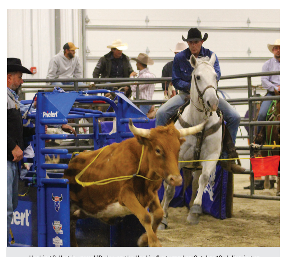
Hocking College's annual "Rodeo on the Hocking" returned on October 19, delivering an exciting evening of team roping, bull riding, and barrel racing, with proceeds supporting the college's Equine Program.