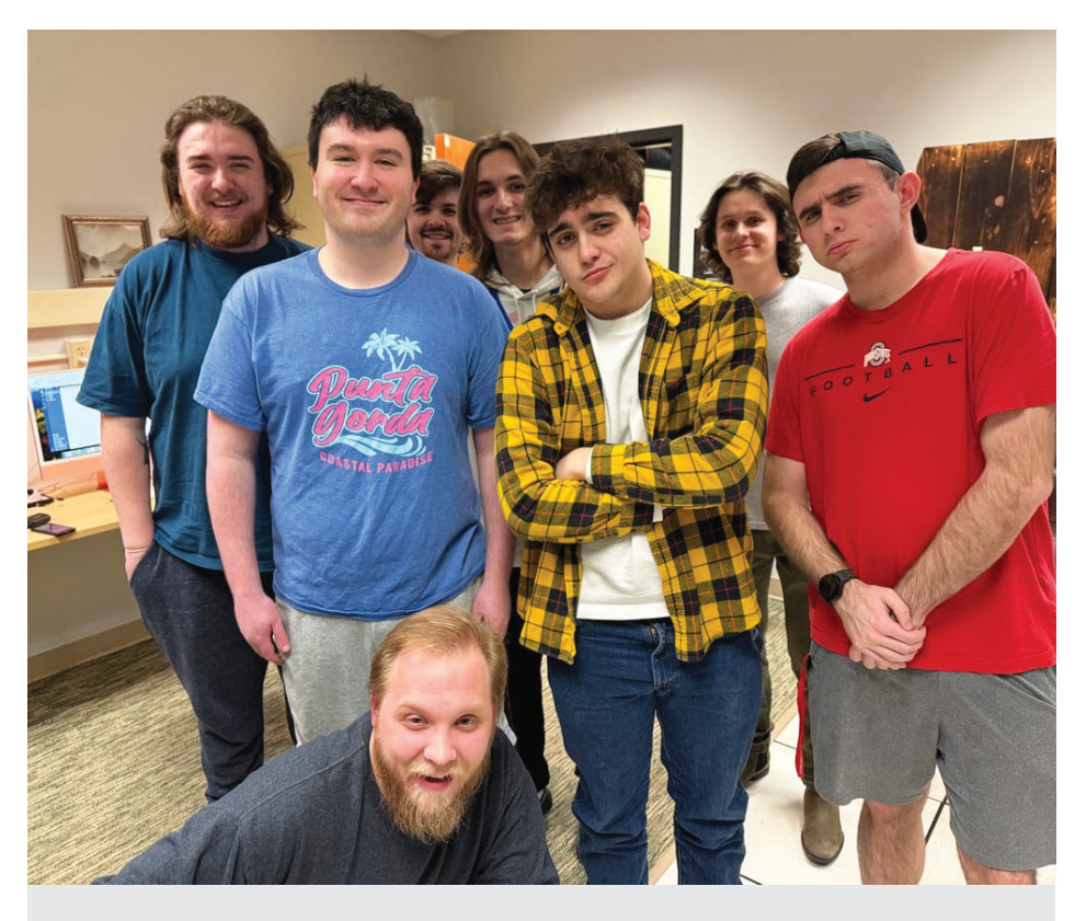
Hocking College's Film Program soared to 3rd place in the 23rd Annual 48-Hour Shootout, outshining seasoned competitors with pure talent, passion, and teamwork!