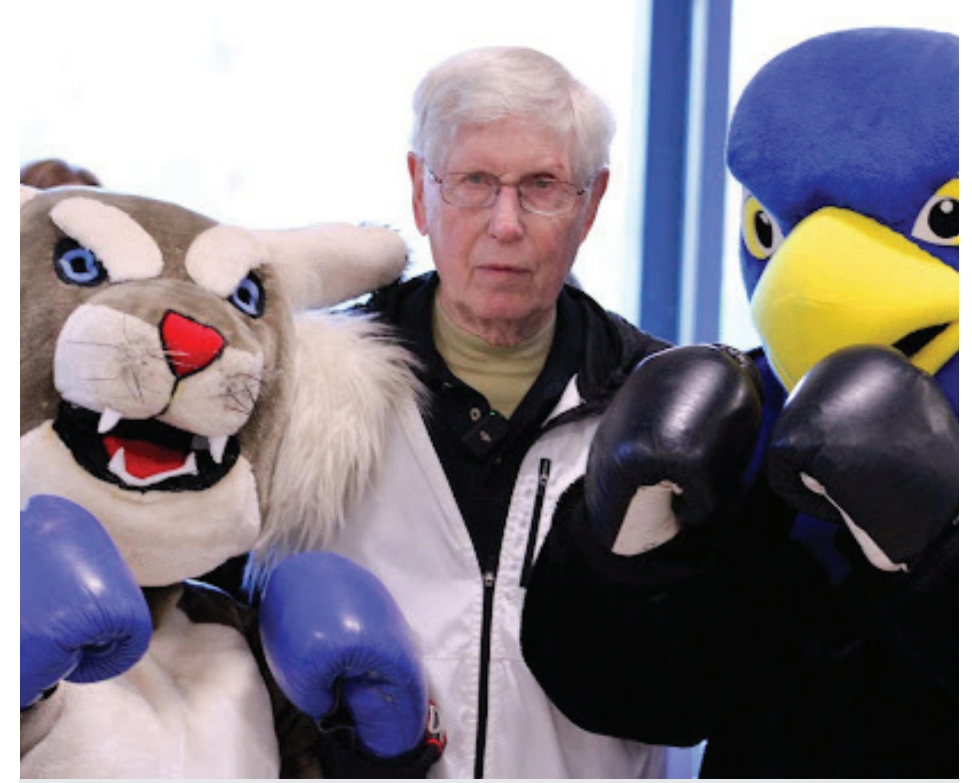
Mark your calendars for April 26 for the Brats and Boxing Exhibition —a high-energy event featuring multiple rounds of boxing. Doors open at 5 PM, with bouts starting at 6 PM. Ticket prices are set at $15 for singles, $25 for couples, and a special rate of $10 for Trimble and Hocking students, with sponsorship tables available for $300. This exhibition promises an action-packed evening—just note that alcohol will likely not be served.